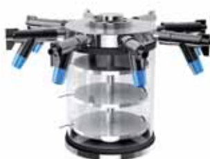
Standard chamber with 8 port manifold