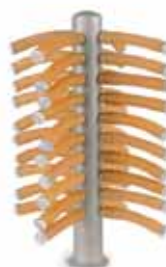
40 port manifold