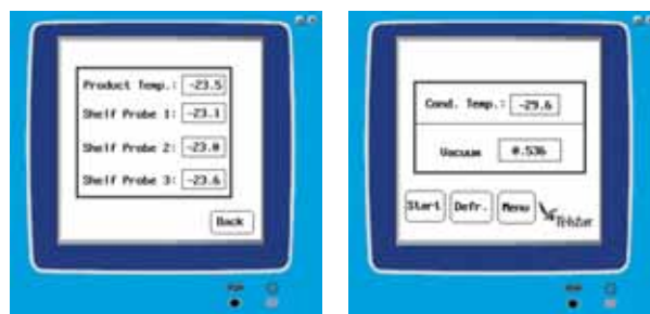
LyoQuest control panel screens

Based on more than 40 years of experience, Telstar introduces the LyoQuest as state of the art in performance and process control. The unit was specifically developed for basic research in biotechnology and scientific institutes.