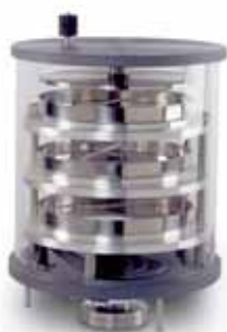
Large capacity chamber