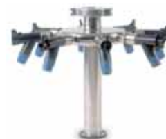
8 port manifold