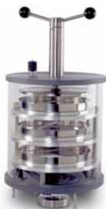
Large capacity stoppering chamber