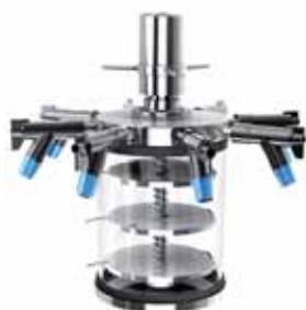
Standard stoppering chamber with 8 port manifold