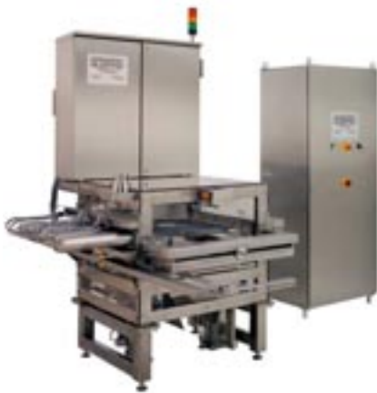
ultrasonic cutting system (8 blades)

The ultrasonic processors UIC400, UIC500 and UIC1000 with a power of 400, 500 or 1000 watts, respectively, and a frequency of 20kHz are developed especially for cutting tasks. This cutting method is nowadays a proven technique, in particular for cutting plastic sheets, textiles, cardboards, rubber, plastics and food. In general ultrasonic cutting means the excitation of a cutting tool or of the counter-bearing. The main advantage is the significant better cutting quality. Lower feed force permit higher cutting speed. Sludge cakings at the blades are removed by the ultrasonic oscillations. The lower wear of the tools and the resulting longer durability have a cost-saving effect.