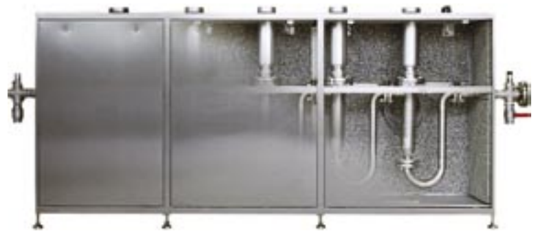
10kW ultrasonic flow system/sound protection (5 x UIP2000)