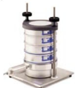
UIS250L at lab sieve tower