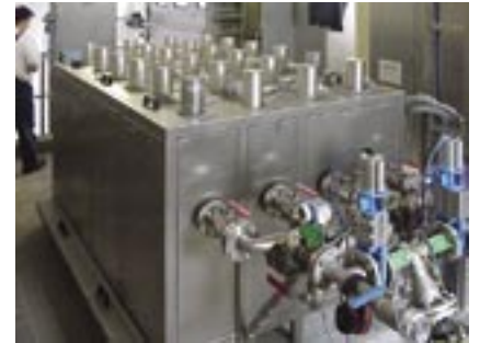
48kW flow system (24 x UIP2000)