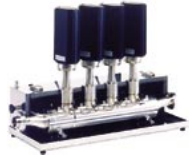
flow cell for food (4 x UIP500)