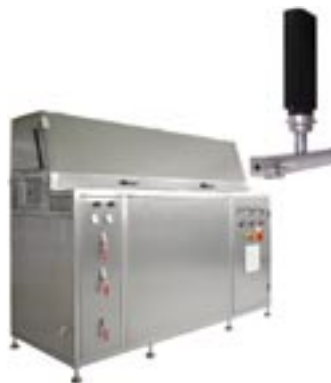
wire-, tape- and profile cleaning