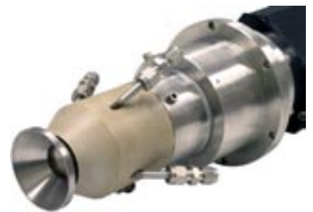
UIP1000 with sonotrode for nebulizing