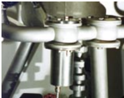
UIP50 for the cleaning of sensors

The ultrasonic processor UIP50 with a power of 50 watts and a frequency of 30kHz as well as the UIP250 with 250 watts and 24kHz are alternatives to the laboratory devices with similar power. They are used for hostile operation conditions. The robust aluminium housing of the transducer with its degree of protection (IP54) withstands dust, dirt, higher temperatures and humidity. The generator, supplied in a housing or as plug-in module for a cabinet, can be located outside the hazard zone.