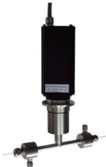
UIP250 with mini flow cell

The oscillating-free flange of the transducer permits positioning accurately in machines or robot arms. For the sonication of liquids at higher temperatures of up to 300°C and pressures of up to 300 atm we offer longer sonotrodes with pressure-tight flange connections.