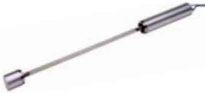
UIC1000LB with long blade (800mm)