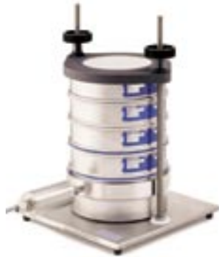
ultrasonic sieving in the laboratory