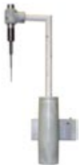
UIP50 as OEM-component