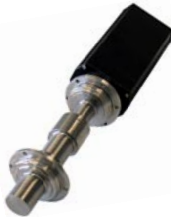
UIP1000 and sonotrode with flange

For use in the food or pharmaceutical industry, these ultrasonic processors are available with stainless steel housings.