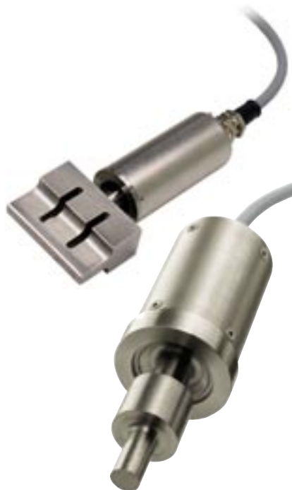
UIW300 and UIW800

With such ultrasonic energy, the thermoplastic material will be preheated and becomes soft or liquid. This effect is used for forming and connecting the individual materials. It is also satisfactory, if only one component is thermoplastic or if a thermoplastic adhesive is applied between the components. The advantage of the ultrasonic welding compared to thermal welding is a shorter time cycle, a higher quality, lower energy consumption as well as the avoidance of heat and damaging steam effects. The ultrasonic processors weld straight pieces or surfaces. The sonotrodes i.e. the welding heads can be customized according to the geometry of the lines or surfaces. The