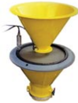
industrial ultrasonic sieving