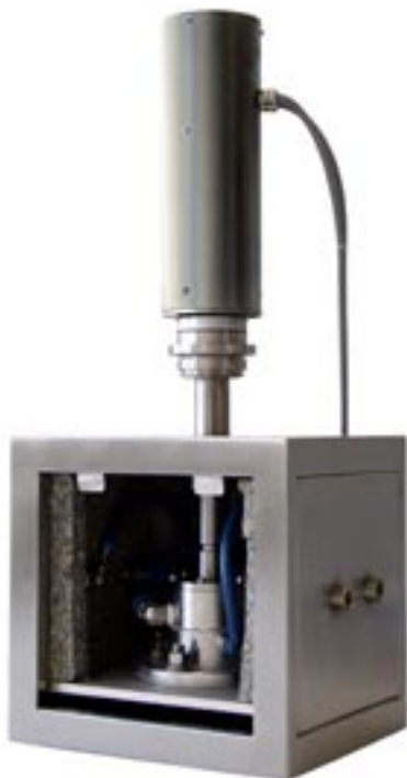
UIP2000 with flow cell/sound protection

Despite the enormous power of the ultrasonic processor UIP2000 (2000 watts, 20kHz), the device does not need any additional cooling by water or compressed air. The device works continuously in air. The robust design of the transducer, made of stainless steel and titanium, enables use under extreme conditions of dust, dirt, higher temperatures and humidity. The transducer and in special cases also the generator can be designed as ex-proof versions. According to the