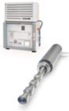
ultrasonic industry processors