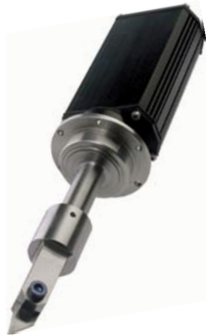
UIC400 with short blade

Exchangeable blades, which are selected to the cutting criteria of the respective application case such as the material, shape and length, are used as tools. The ultrasonic processors can also be constructed for the use in the food industry.