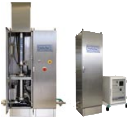
ultrasonic dispersing systems