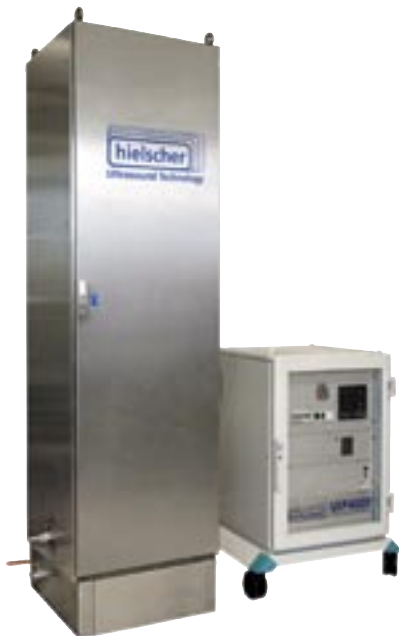
UIP4000 with flow cell/sound protection

The UIP4000 (4,000 watts, 20kHz) is used mainly for the industrial processing of liquids such as homogenizing, dispersing, disintegrating or deagglomerating.