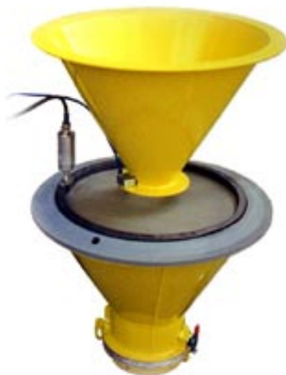
UIS500 at sieve frame

lar to the construction of the laboratory sieving tower, the transducer is also installed outside the industrial sieves. Therewith a contact between the material to be sieved and the transducer is avoided, which is an advantage, in particular decisive regarding thermo-sensitive powder. The transducer can also be supplied as ex-proof version. Please ask for our detailed sieving information for laboratories or industries.