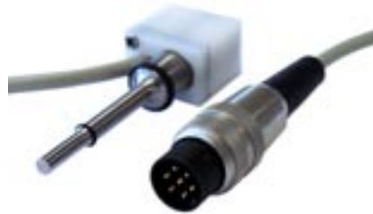
UIP12 (90kHz) as OEM-component

textile ribbons directly at the loom. If the ultrasonic processor is manufactured as handheld device both an ergonomic friendly design and the safety standards e.g. in the medicine or food industry have to be considered.