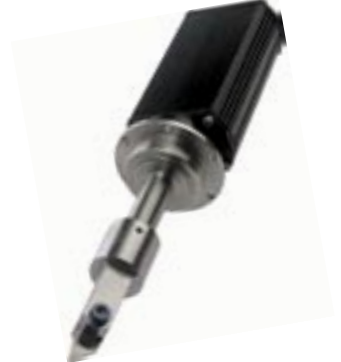
cutting and welding