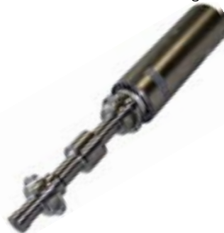
UIP2000 and sonotrode with flange

Despite the enormous power of the ultrasonic processor UIP2000 (2000 watts, 20kHz), the device does not need any additional cooling by water or compressed air. The device works continuously in air. The robust design of the transducer, made of stainless steel and titanium, enables use under extreme conditions of dust, dirt, higher temperatures and humidity. The transducer and in special cases also the generator can be designed as ex-proof versions. According to the