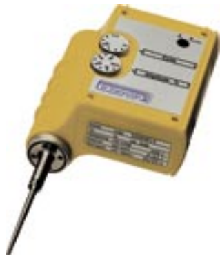
ultrasonic laboratory processors