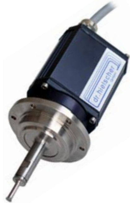
UIP25 with sonotrode for nebulizing