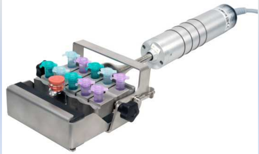
UP200St-T, VialTweeter & VialPress