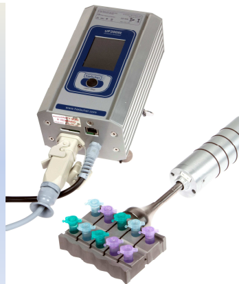
UP200St with VialTweeter

Ultrasonic Processor UP200St with VialTweeter