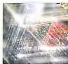
Incident fluorescent illumination - Diamond Light

Dark field is the ideal illumination for observation of inclusions. With Motic's versatile aperture diaphragm [pictured above], you can control the depth of field and contrast while using the dark field illumination for better identification.