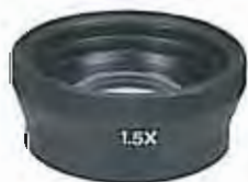
1.5x auxiliary objective

Additional magnification with the truest optical clarity and large field of view.