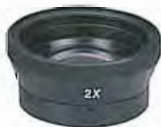
2.0x auxiliary objective

54mm working distance 75x maximum magnification *