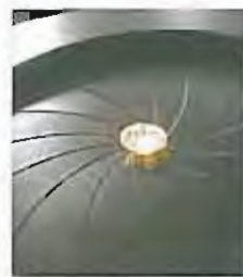
Bright field Illumination

Integrating a consistent and powerful 30W Quartz Halogen Bright field illumination with a precise, adjustable aperture diaphragm [Ø41mm - Ø2mm], you are able to measure with a table gauge the proportions and pavilions of a diamond.