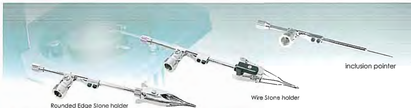
Rounded Edge Stone holder