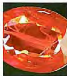
Dark field Illumination

Integrating a consistent and powerful 30W Quartz Halogen Bright field illumination with a precise, adjustable aperture diaphragm [Ø41mm - Ø2mm], you are able to measure with a table gauge the proportions and pavilions of a diamond.